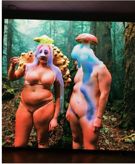
Transfungus by Gints Gabrāns, 2023 Shark bag by Lily Chen, 2023

A Pandora's box tradition: funky creatures The aim?